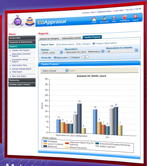
Make Walk-Throughs Meaningful